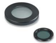
Simple polarising attachment