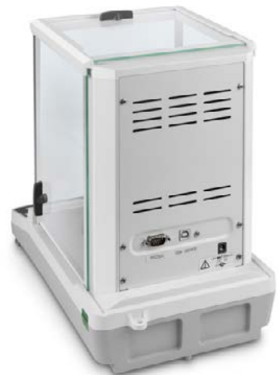
KERN ACS/ACJ with standard data interface RS-232 and USB data interface

The bestseller in analytical balances, with high-quality single-cell weighing system, also with EC type approval [M]