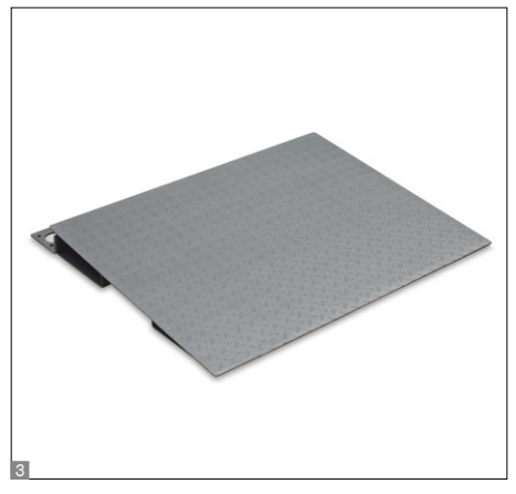
■ Access ramp incl. pair of base plates to facilitate access of e.g. wire cage trolleys, shelf trolleys, container trolleys, storage trolleys, sack trucks, transpallets, mobile containers, containers refuse etc.

Our floor scales are delivered in a robust wooden box. This protects the high-quality weighing technology from environmental influences and stresses during transportation. KERN – always one step ahead