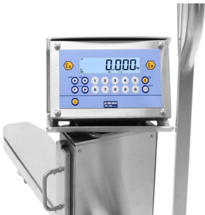
Orientable Head (OPTIONAL)