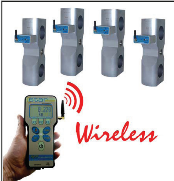
Overhung loads monitoring by using T20, D200 etc. ... dynamometers or load cells

It is possible to simultaneously connect to the WiSTAR (through a Wireless connection) n° 1, 2, 3 or 4 WIMOD modules directly connected to the load cells or in the stand alone mode.