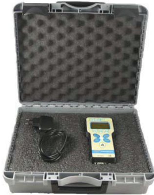
Travelling case made of ABS