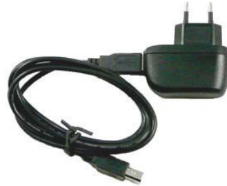
Feeder with USB cable