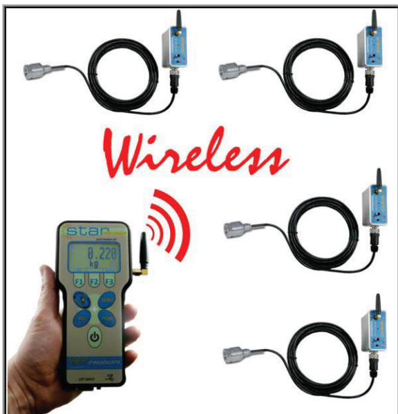
Monitoring of pressures by using con TP1 and TP16 pressure transducers.