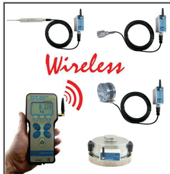
Monitoring of different sensors for example: LDT for displacement measurements TP1 for pressure measurements TRX for torque measurements. C2S for force or weight measurements.