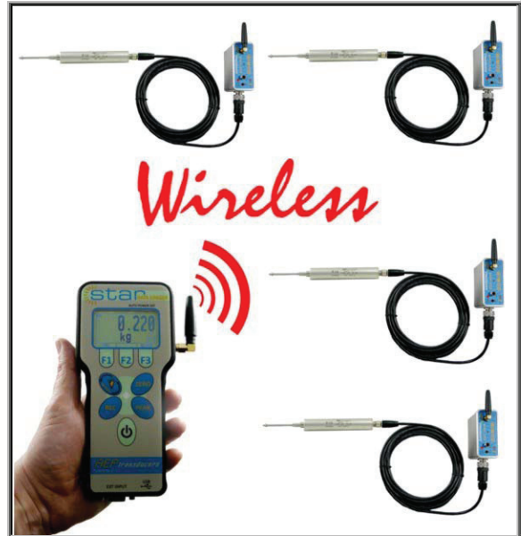
Displacements Monitoring by using LDT transducers.