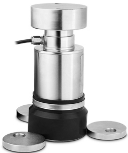
Assembly kit for RCPTx0C3NC cells.