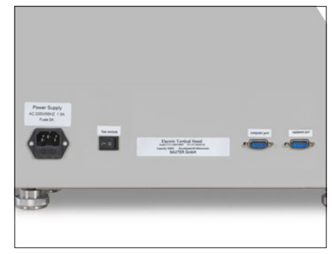
Interface for data transmission from SAUTER FH measuring device and for controlling the test stand with SAUTER AFH software