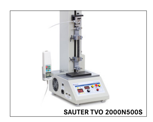
Solid and flexible fixing options for many terminals and accessories from the SAUTER product range, see accessories on page 35 et seq.