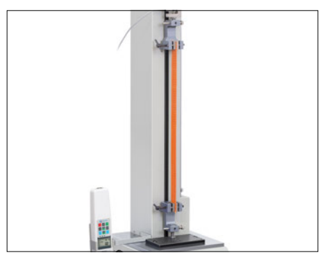
A wide range of application possibilities because of its large travelling distance