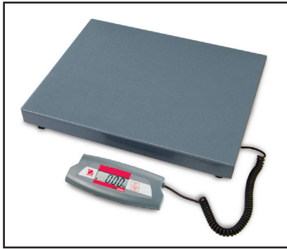
75kg and 200kg models available with large platform