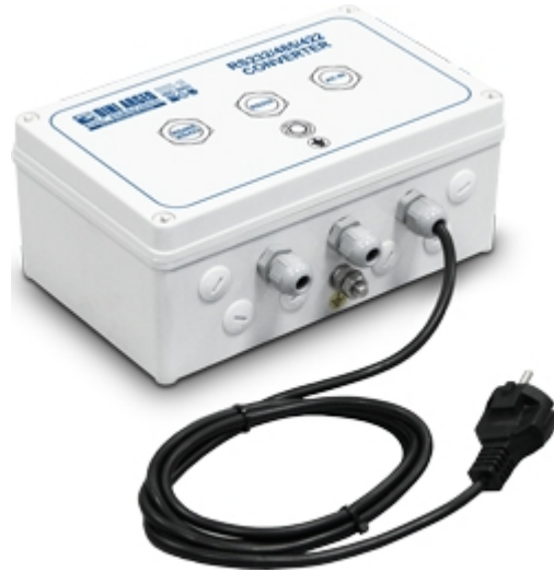
C232485: RS232 / RS485 converter for counter-top use

SETHDIN: Example of installation with DGT4