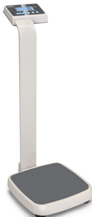
KERN MPE-P with stand