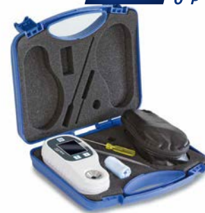
Transport and storage case