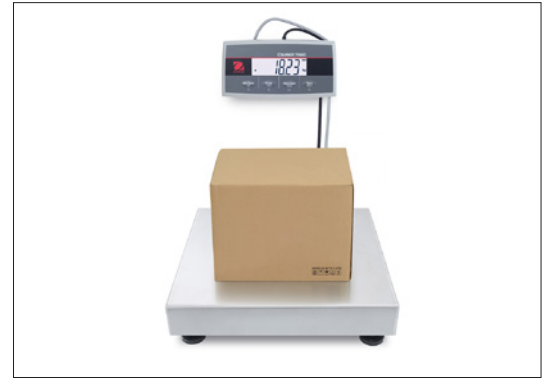
Integrates with shipping system software

The large, bright display clearly shows weights in dimly-lit warehouse and loading dock areas. The indicator comes base mounted but can be attached to a column for display above the platform. A second Remote Display and column can be used to show the results for added verification.