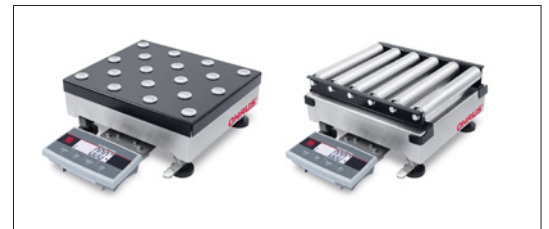
Ball Top and Roller Top Platform Options

Provides simple averaging of weights for unstable loads.