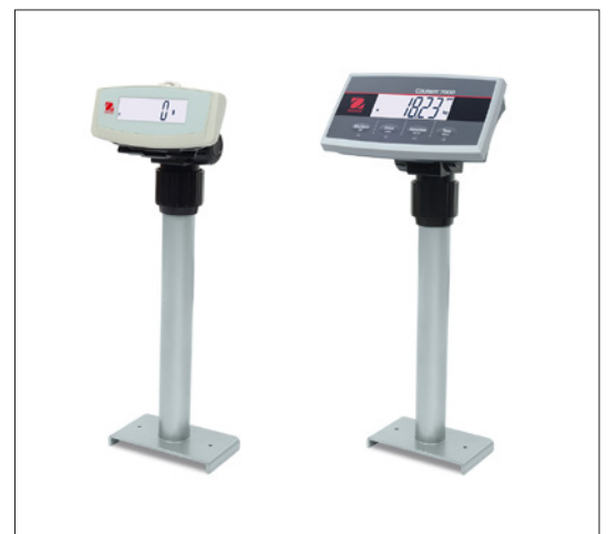
Optional Remote Display on column mount and Column Mount for scale indicator available