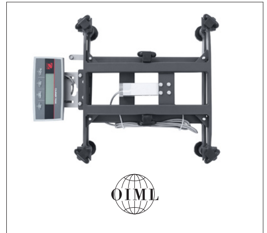
Sturdy powder-coated steel frame holds up to heavy daily shipping use