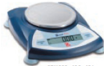
SPU202, 402, 401