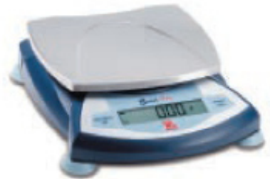
SPU601, 2001, 4001, 6000